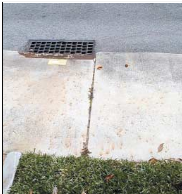
Figure 3. Poor fertilization technique wastes fertilizer, causes unsightly stains, and pollutes our waterbodies. Note the trail of stains on this sidewalk.

Inadequate nutrition results in thin, weak plants that may be more susceptible to insects, weeds, and diseases. Certain diseases, such as rust and dollar spot, can occur in turf maintained under low-nutrient conditions. Overfertilization can also enhance plant susceptibility to pests and diseases. Several pesticide applications may be required to alleviate problems that would not have been as prevalent under a proper nutrition program. Proper fertilization can alleviate these conditions.