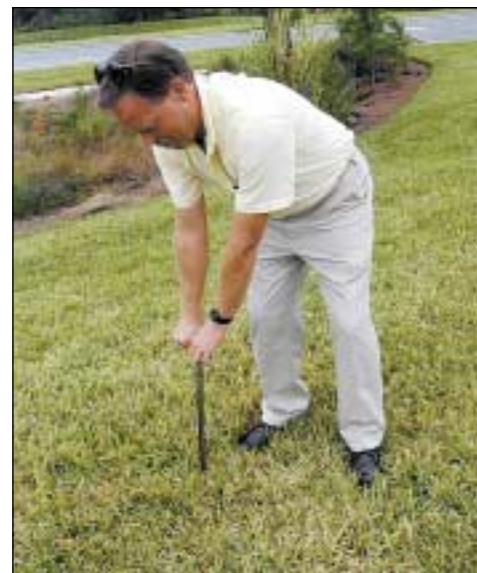
Figure 22. Taking a soil sample.

Although it may not be an essential practice for the everyday maintenance of a healthy landscape, testing to determine the soil's chemical properties before installing turfgrass or landscape plants is a recommended practice. Through soil testing, the initial soil pH and P level can be determined. Soil pH is important in determining which turfgrass is most adapted to initial soil conditions (bahia grass and centipedegrass are not well adapted to soil with a pH greater than 7.0). Since it is not easy to reduce the pH of soil on a long-term basis, you should use St. Augustine grass or bermudagrass on high-pH soils.