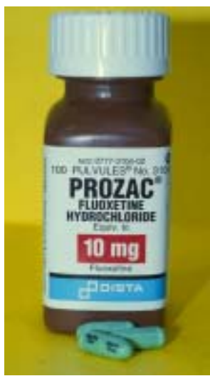
Fig. 3. Side effects of Prozac®, the fifth most commonly prescribed medication, include all five symptoms commonly attributed to delusory parasitosis—erythema, paresthesia, pruritus, rash, and urticaria.

medications per day, 15 different prescriptions per year, and consume 70% of all over-the-counter drugs. Approximately 25% of their hospital admissions are a result of incorrect prescription drug usage. One in five Americans over the age of 60 regularly takes pain medication and one in four who does so experiences side effects caused by the medication; one in ten is hospitalized as a result (Chrischilles et al. 1992).