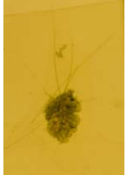
Fig. 2. A scab with entrapped hairs and fibers is said to look like a "bug."