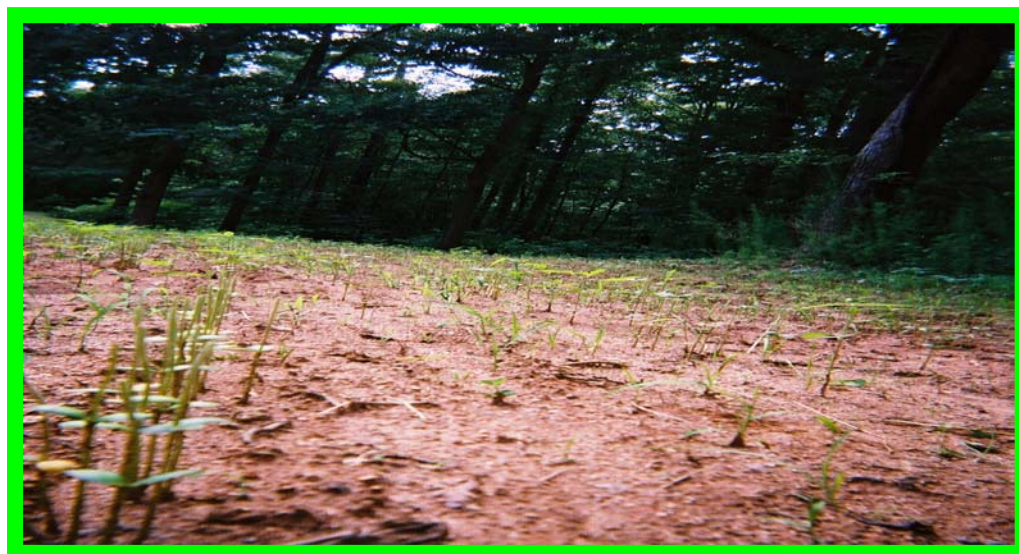
Figure 2. Heavily damaged (most plants were “browsed”) control plot on Day 9 after soybean emergence.