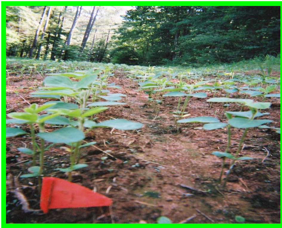
Figure 3. Undamaged (“unbrowsed”) soybean food plot at 9 days after soybean emergence following Milorganite treatment.