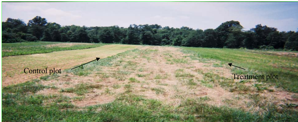
Figure 1. At each of 5 north Georgia properties, 2 - 0.2 ha food plots (control on left and treatment on right) were established with 15-300 m of natural vegetation separating the plots.