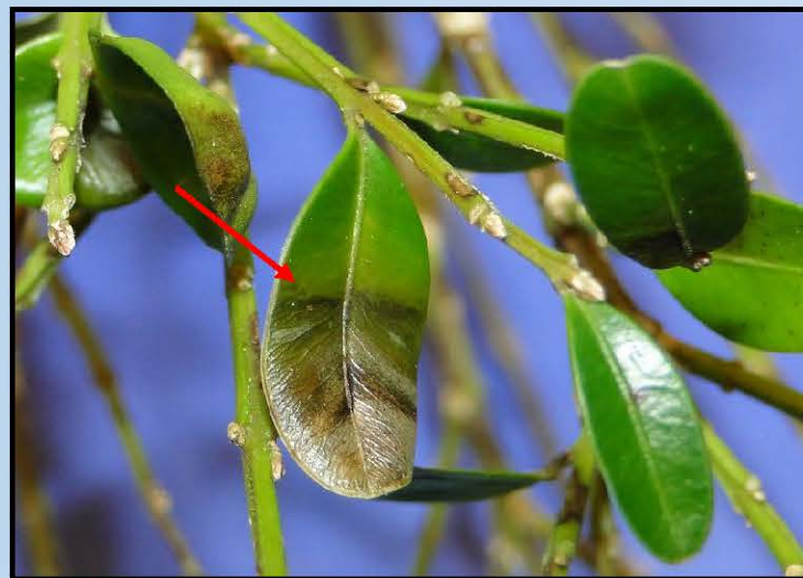
Zonate leaf lesions.