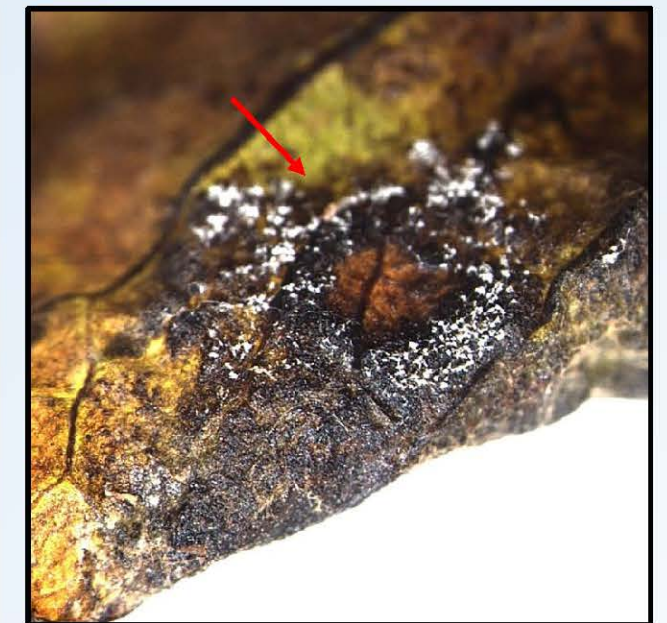
Stem lesions on pachysandra (left) and fungal spores on lower surface of pachysandra leaves (right).

For more information: www.ct.gov/caes/boxwoodblight www.boxwoodblight.org