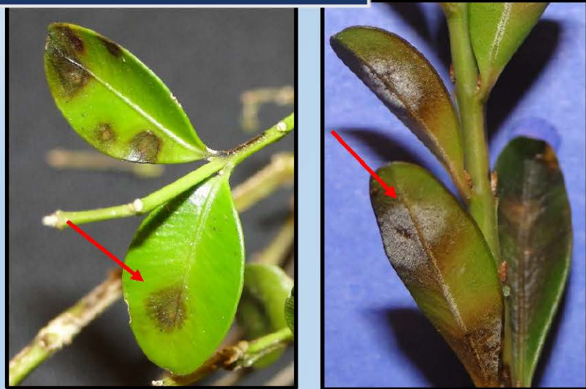
Dark leaf spots (left) and spores of the boxwood blight fungus ( Calonectria pseudonaviculata ) on lower leaf surfaces (right).