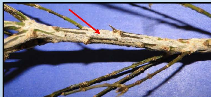
Black stem lesions.